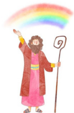
Warning to enter the Ark of Noah before the Flood.