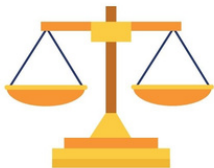
Current Evangelists' warning to choose the right side before God's Judgment Day