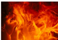
Warning to leave Sodom and Gomorrah before it burnt with fire